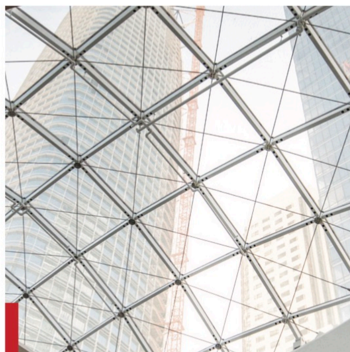
Transbay Terminal San Francisco, CA, USA

6mm Guardian Crystal Grey Laminated with Embedded 6mm SN 68 Clear